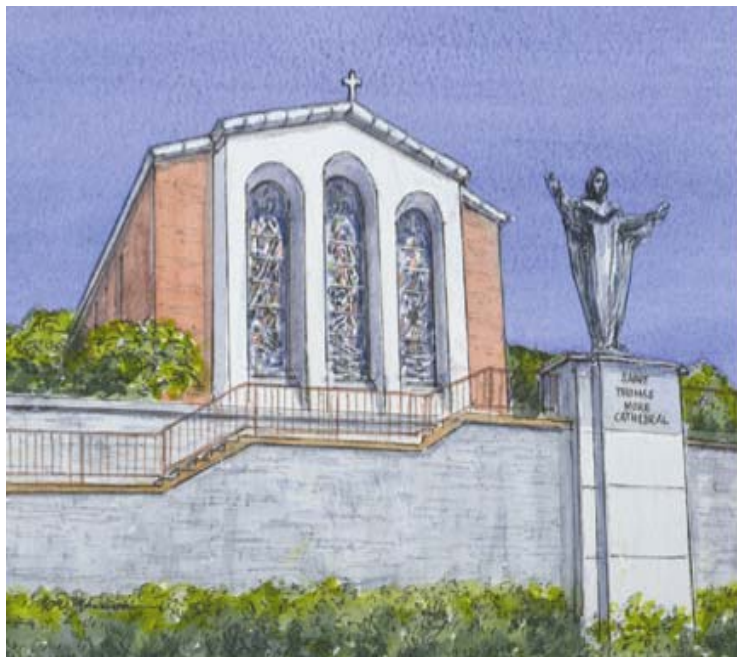
The west windows are dedicated to St. Thomas More. The bronze statue of Christ the Redeemer overlooks the traffic on Route 50.