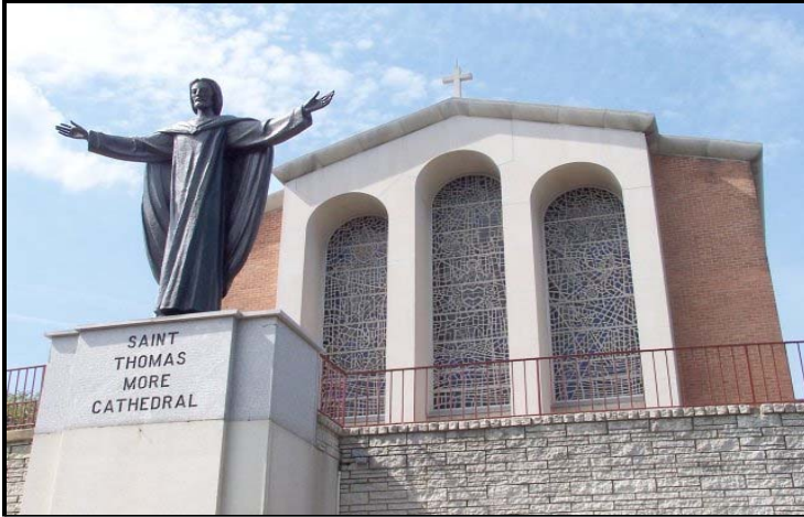
The west windows are dedicated to St. Thomas More. The bronze statue of Christ the Redeemer overlooks the traffic on Route 50.