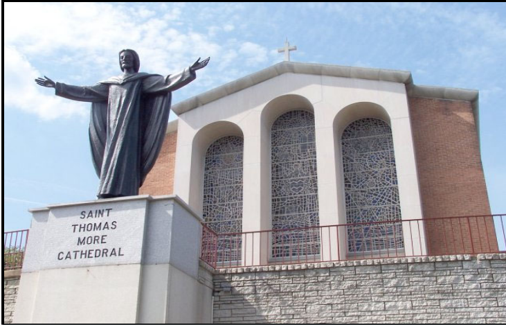
The west windows are dedicated to St. Thomas More. The bronze statue of Christ the Redeemer overlooks the traffic on Route 50.