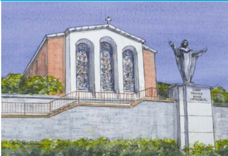
The west windows are dedicated to St. Thomas More. The bronze statue of Christ the Redeemer overlooks the traffic on Route 50.