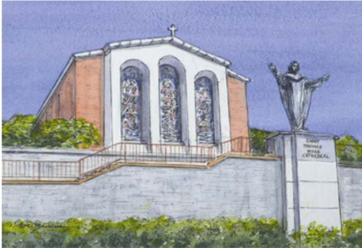
The west windows are dedicated to St. Thomas More. The bronze statue of Christ the Redeemer overlooks the traffic on Route 50.

Thirteenth Sunday in Ordinary Time Extraordinary God