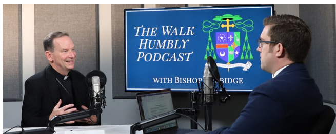
Bishop Burbidge Podcasts Listen here: https://bit.ly/2Viwb15