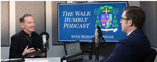
Bishop Burbidge Podcasts Listen here: https://bit.ly/2Viwb15

Were you married in 1970 or 1995? Then join Bishop Burbidge for the 2020 Mass for Jubilarians to be celebrated on Sunday, October 4th at 2:30pm at the Cathedral. Contact the parish office to register no later than September 18th. For more information, please go to: www.arlingtondiocese.org/mjm