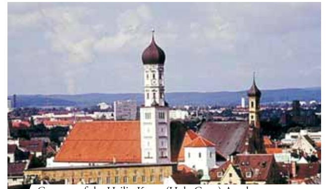
Convent of the Heilig Kreuz (Holy Cross) Augsburg