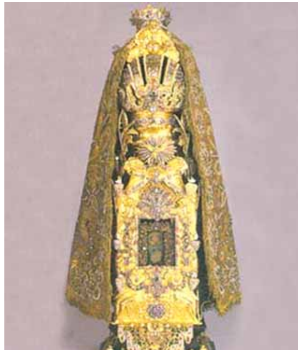
Reliquary containing the Host of the miracle known as Wunderbarlichen Gutes

The Eucharistic miracle of Augsburg, is known locally as Wunderbarlichen Gutes – “The Miraculous Good”. It is described in numerous books and historical documents that can be consulted in the civic state library of Augsburg. A stolen Host was transformed into bleeding Flesh. In the course of the centuries, several analyses were completed of the Holy Particle that have always confirmed that human Flesh and Blood are present. Today the Convent of the Heilig Kreuz (Holy Cross) is taken care of by the Dominican Fathers.