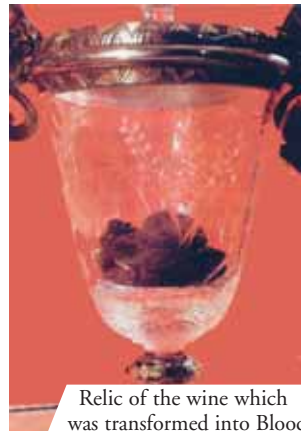
Relic of the wine which was transformed into Blood