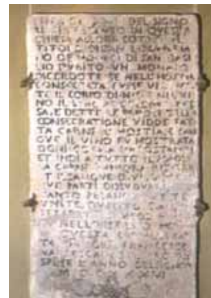
Stone tablet from 1631 which describes the miracle