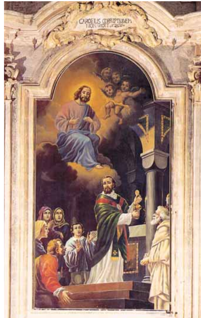
Painting located in the Valsecca chapel which depicts the miracle