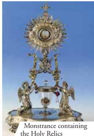
Monstrance containing the Holy Relics

An inscription in marble from the 17th century describes this Eucharistic miracle which occurred at Lanciano in 750 at the Church of St. Francis. “A monastic priest doubted whether the Body of Our Lord was truly present in the consecrated Host. He celebrated Mass and when he said the words of consecration, he saw the host turn into Flesh and the wine turn into Blood. Everything was visible to those in attendance. The Flesh is still intact and the Blood is divided into five unequal parts which together have the exact same weight as each one does separately.