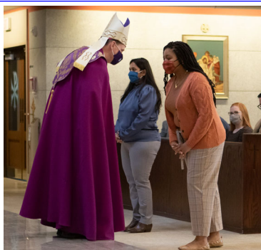
2021 Rite of Election Sunday, February 21, 2021