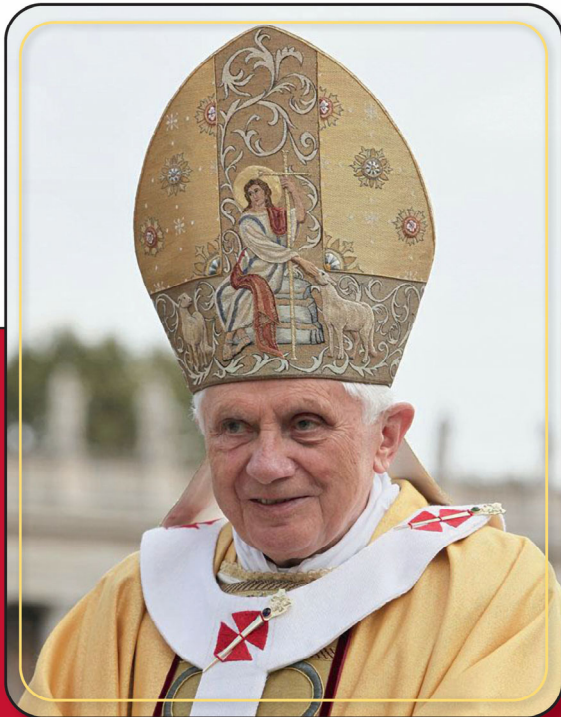
POPE EMERITUS BENEDICT XVI