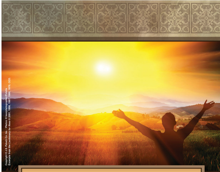
Excerpt from the Lectionary for Mass © 2001, 1988, 1974, 1958, 1970, CCO

ONE OF THE LEPERS, REALIZING HE HAD BEEN HEALED, RETURNED, GLORIFYING GOD IN A LOUD VOICE. LUKE 17:15